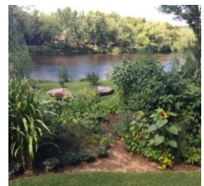
Thérèse Fleurant : winner 2016 et 2017 – Category Single family home